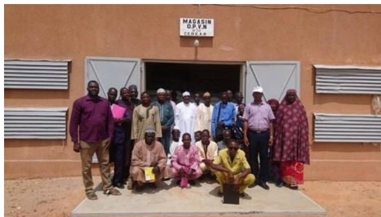
Family picture of the Maradi training participants

To learn more about the training, click on: https://stock-ecowas.info/index.php/2018/12/03/formation-maradi-niger/